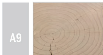
cedarwood contract finish