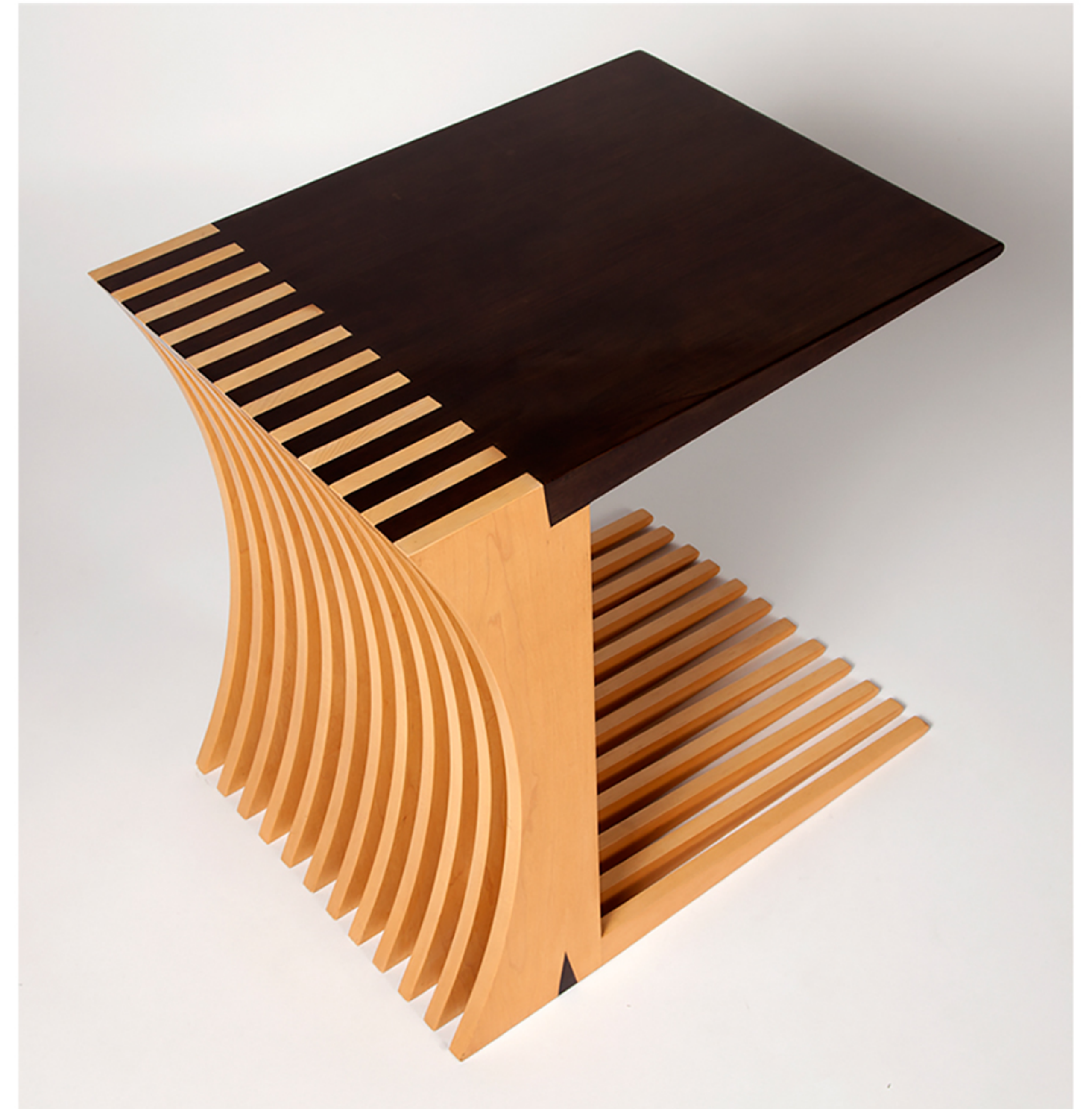
26 H 20 W 26 D alder, walnut woods

"I design to explore the possibility - to create relevant, enduring, functional art. There is a human need to evolve and we are raising the standard in our disposable culture. When it seems that everything has been done, we continue to create new solutions. Inspiration is everywhere. Dark and light woods create the contrast with the Slide Table. The receptive ribs reflect light to play with negative and positive space to accentuate craftsmanship."