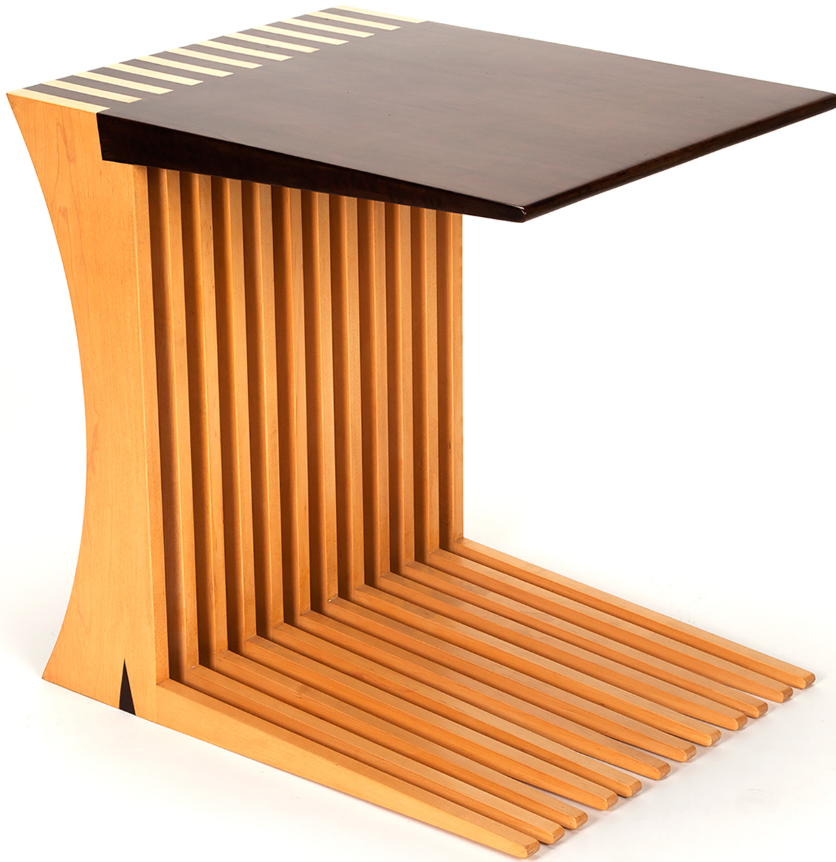
B. David Levine 'Slide Table' 2014